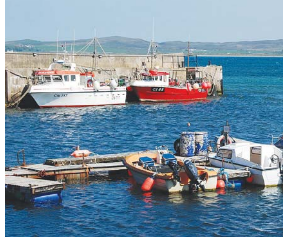
Bowmore Harbour, Isle of Islay

Islay malt whisky is world famous, Ardbeg, Lagavullin, Laphroaig, distilled in