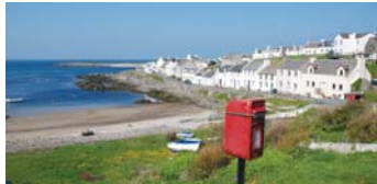
The village of Portnahaven, Isle of Islay

Covering 600 square kilometres and with a population of 3,000, Islay is easy to reach. Transport links are good by